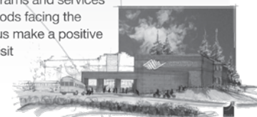
12509 N. Market St. | Mead, WA 99021

bgcspokanecounty.org or contact us at (509) 489-0741.